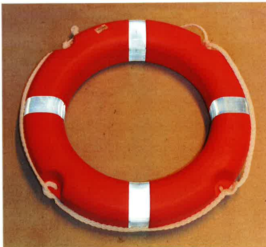
38158 - GIOVE Lifebuoy Ring SOLAS, Ø63cm, 2.5kg